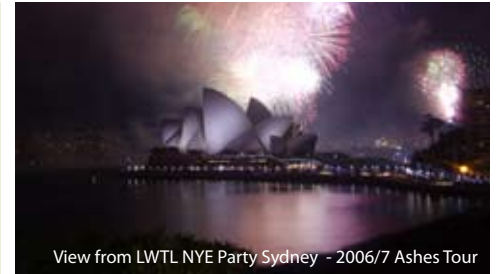
View from LWTL NYE Party Sydney - 2006/7 Ashes Tour

You could not wish to be in a more beautiful city to see in the new year. With the sun only going down at 8pm we will be sure to have a few sundowners before the celebrations begin. Our venue is still to be confirmed but we aim to surpass our spectacular 2006/7 New Years Eve party in Sydney which was held on the roofdeck of the Museum of Contemporary Art.